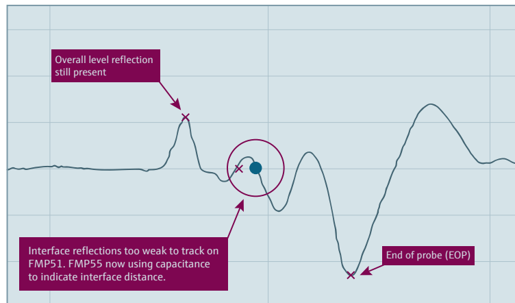
Figure 2: By the afternoon of day 2, the separator had an emulsion layer which resulted in a greatly reduced reflection from the water (interface). At this point, the FMP51 read no interface, but the FMP55 maintained an interface reading by automatically switching to capacitance.