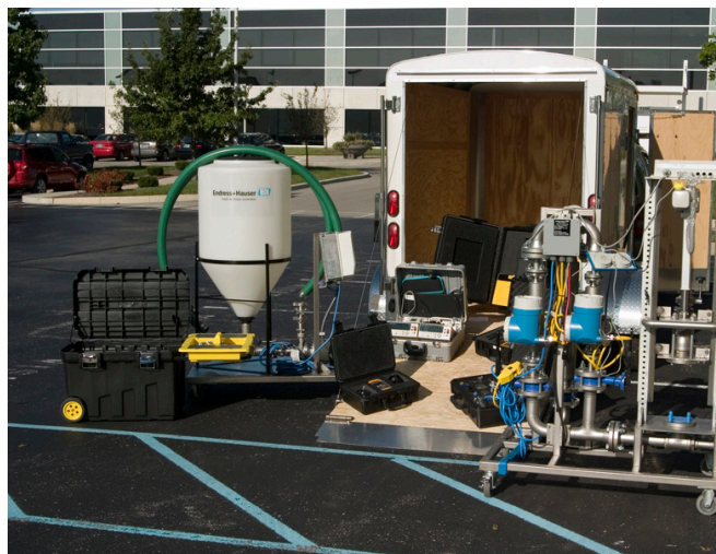
Figures 4 & 5. A portable flow calibration rig performs on-site flowmeter calibration.

Calibration labs typically handle larger size flowmeters with larger flowrates. Portable flow rigs can handle flowmeters up to a maximum of 2" (rig), but larger sizes can be calibrated in-line with master meters. Accuracy is comparable, but the results are still traceable to recognized national standards and the turnaround time is reduced to hours versus days or weeks. For example, Endress+Hauser's on-site flow calibration is accredited in accordance with ISO/IEC 17025.