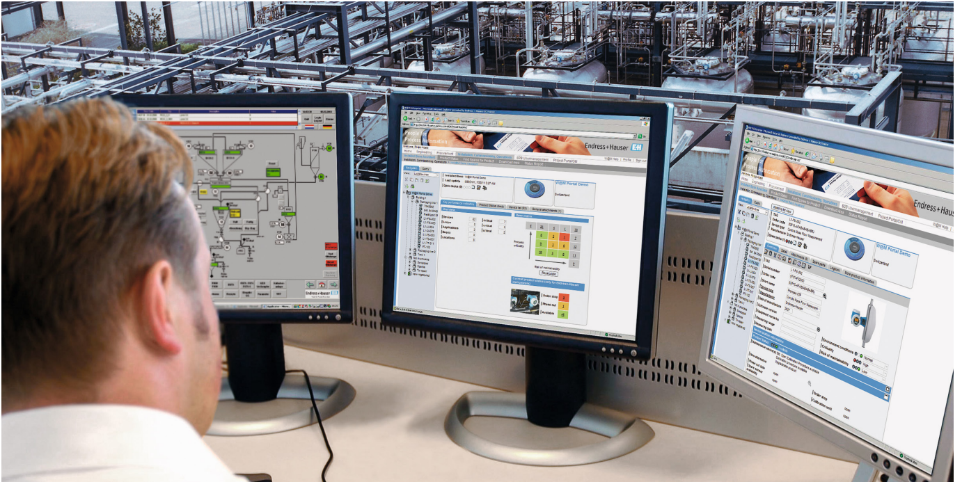
Figure 1. Flowmeter calibration data stored in an asset management system, such as Endress+Hauser's W@M Life Cycle Management System.

Flowmeter data from the analysis should be stored in an asset management, maintenance management, or instrumentation management program. One of the major advances in recent years has been the development of instrumentation management software. These systems provide information such as spare parts lists, drawings specific to the flowmeter, and original calibration data and certificates (Figure 1).