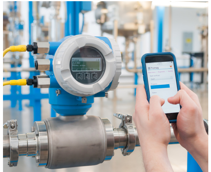
Figure 7. For field verification, a technician connects a smart device to the flowmeter's web server via an optional WLAN connection, up to 15 feet in proximity. The same procedure can be performed via laptop PC and Ethernet connection. The flowmeter does not have to be removed for this procedure.

It is important to distinguish that unlike calibration, verification aims to provide evidence that a flowmeter fulfills certain technical requirements of functionality as defined by the manufacturer. It is usually a very detailed functional test to confirm sensor or transmitter stability and produces a qualitative outcome. This is still a method used by some flowmeter manufacturers today. However, some manufacturers have developed verification methodologies which are built-in to the flowmeter. When selecting a verification technology, it is important to ensure that it is traceable to known metrological standards to ensure quality. Regardless, a verification system acquires a number of flowmeter parameters related to the flowmeter response. These values are evaluated by a dedicated algorithm in the verification system and the system parameter reference values. The result will deliver the current status of flowmeter functionality. The final outcome is a qualitative assessment report based on a pass-fail criterion such as process impacts, drift, or hardware failures. The concept of verification must define the long-term stability of the test system, the stability of internal references, and metrological traceable factory references for user confidence. In many cases, verification can be performed on less critical meters or as a means to extend the calibration frequency.