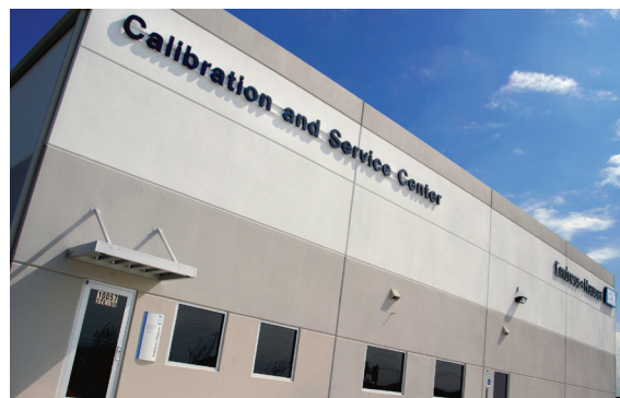
Figure 6. A2LA accredited for calibrations performed at Endress+Hauser's Gulf Coast Calibration & Service Center in La Porte, TX.