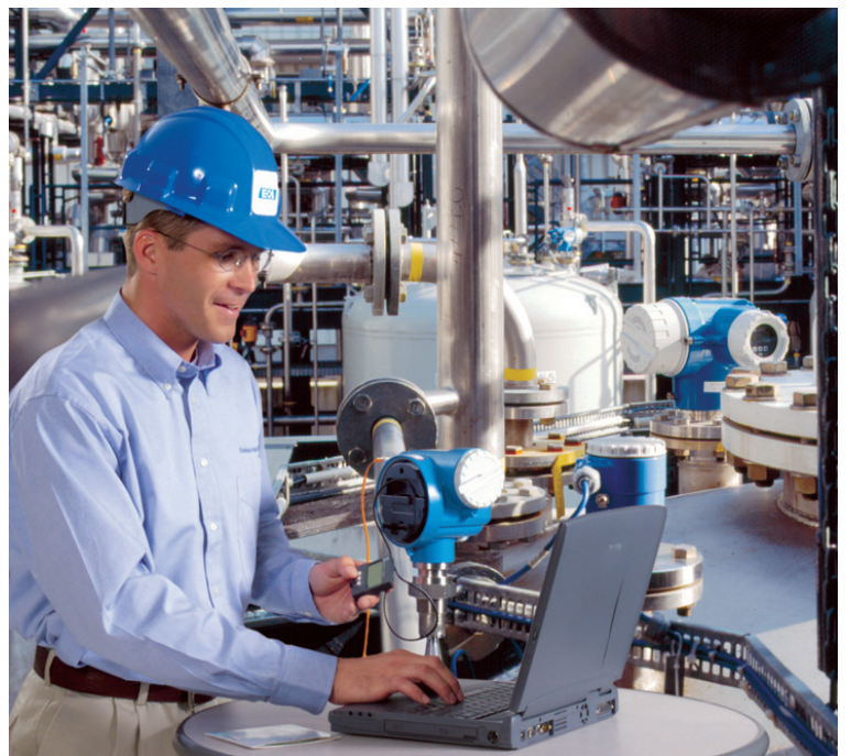
Figure 2. A technician manages a flowmeter's calibration data via a software system, such as Endress+Hauser's CompuCal calibration management system.

Another recent advance allows access to the information in an asset management system by mobile devices used by maintenance personnel (Figure 2). From the field, a technician can pull up the calibration history, diagnostic data, troubleshooting instructions and other information needed to properly diagnose a flowmeter issue