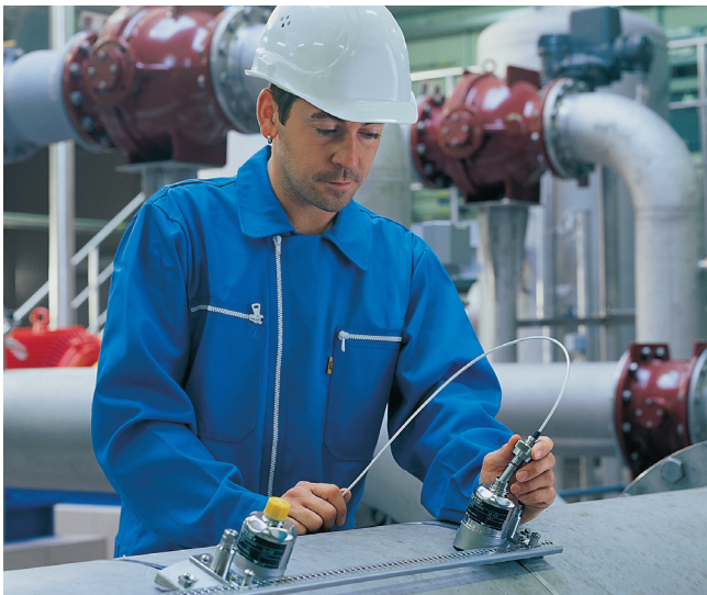
Figure 8. Clamp-on ultrasonic flowmeter used to check flowmeter's operation.

A clamp-on ultrasonic flowmeter can be used to check a flowmeter's operation (Figure 8). While a clamp-on ultrasonic flowmeter typically has only 2–5 percent accuracy, comparing the ultrasonic flow measurement to that of the installed flowmeter can provide some level of confidence that the meter being tested is operating properly. Such a test is often performed in conjunction with verification on very large flowmeters in water and wastewater applications, or on other flowmeters that are difficult to remove for full calibration testing.