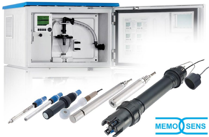
Figure 1: A modern sampling station, such as this Endress+Hauser Liquistation, can accommodate up to four additional process sensors, such as pH, conductivity, total suspended solids/turbidity and dissolved oxygen, to provide information that the W&WW plant can use to control processes.

While most automatic sampling systems are used to meet EPA regulations, and are therefore installed on the output side of a water and wastewater plant, samplers can be installed anywhere in the process as required to control, monitor and improve operation.