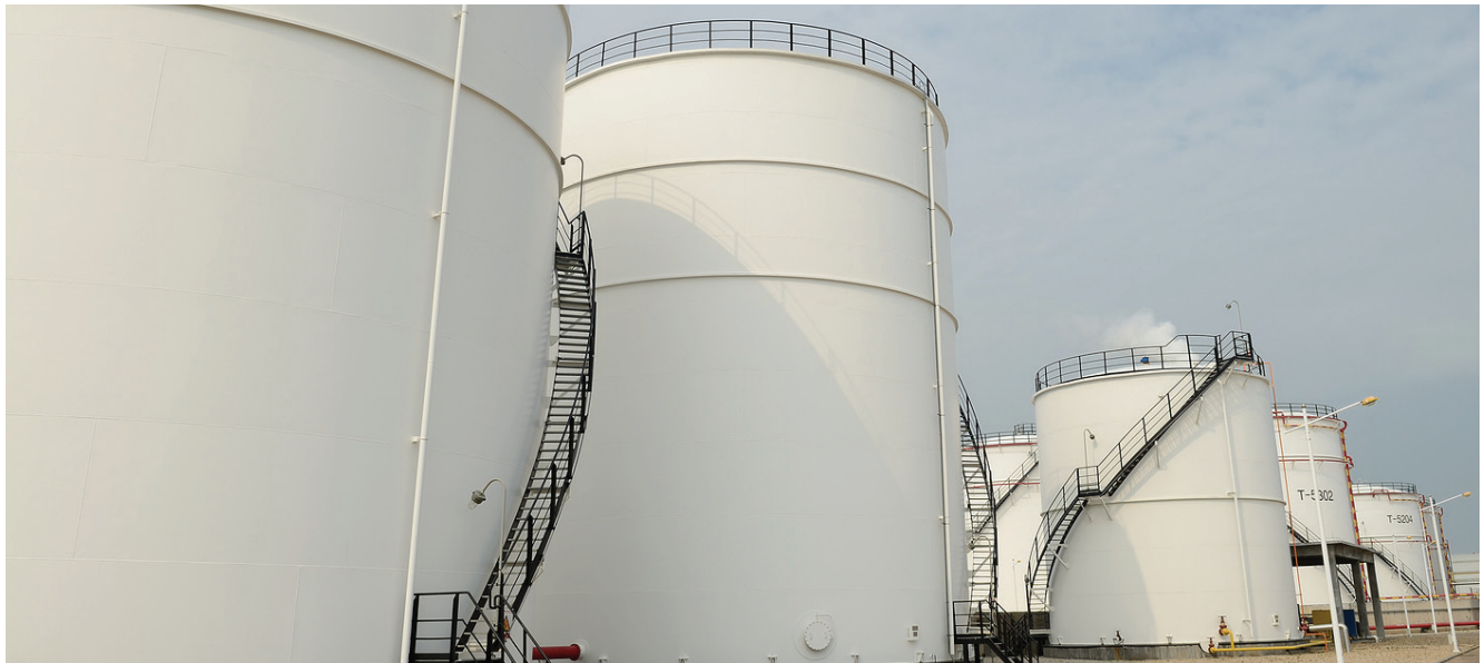
Figure 1: Storage tanks containing dangerous chemicals require multiple levels of instrumentation, controllers and software that can monitor the contents of a vessel and provide an alarm in the event of a leak or overflow event.