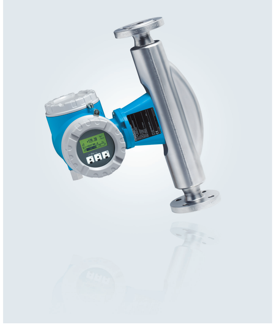
Proline Promass 83F Coriolis flowmeter

Results: After installation of the Promass 83F, the pharmaceuticals company increased uptime to meet production requirements and saw consistent results. Furthermore, the mass method resolved deviations more efficiently than the previous scale method.