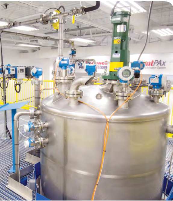
Endress+Hauser Process Training Unit (PTU) demonstrating PlantPAx distributed control system