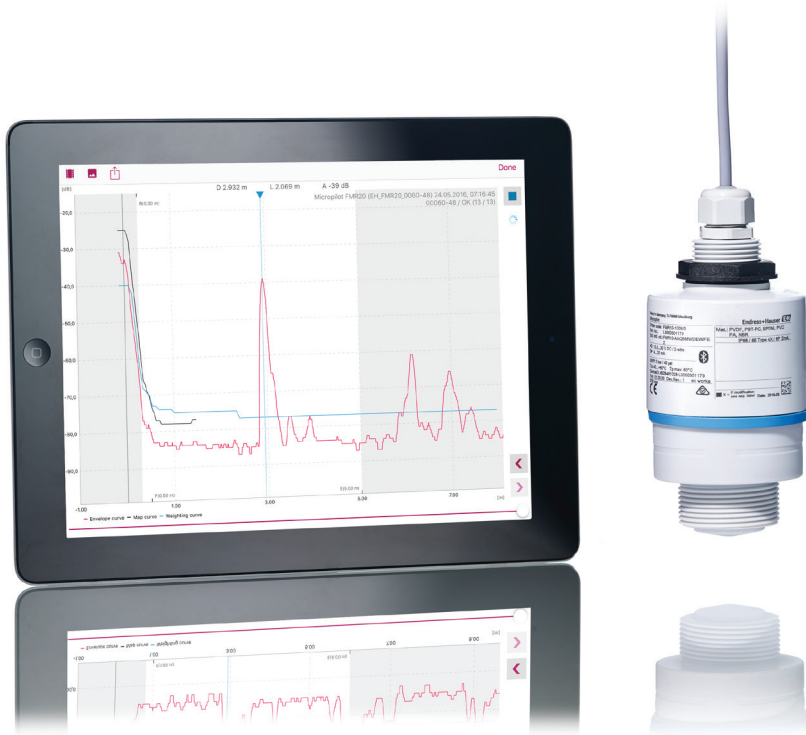
FIGURE 2. With Bluetooth, modern radar level transmitters can be commissioned from a tablet (pictured) or a smart phone.