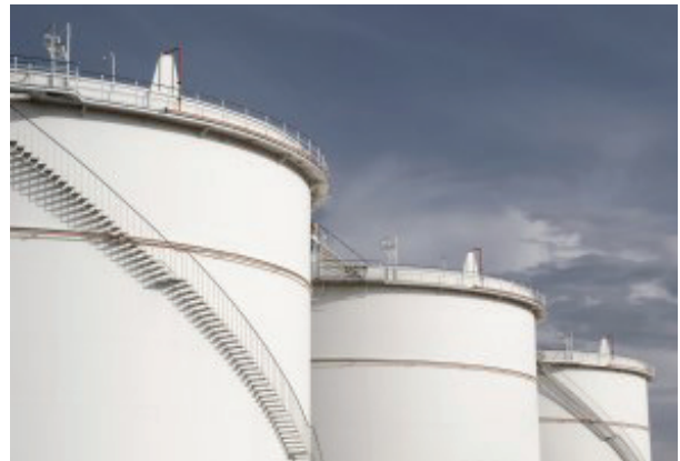
Figure 1: Smart level instruments no longer require an operator to climb to the top of a tank roof when calibrating or verifying level instrument operation

Tank gauging and sampling activities can expose workers to high concentrations of hydrocarbon gases and vapors (HGVs), in some cases at levels immediately dangerous to life and health. Any time a thief hatch is opened, HGVs and oxygen-deficient components are released through the hatch into the employee's breathing zone. There is also the potential for life-threatening concentrations of hydrogen sulfide gas to be released where "sour" oil and gas