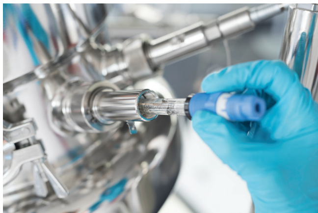
Figure 2: Glass pH sensors are fragile. Handle carefully.

pH sensors are fragile, so handle them carefully (Figure 2). Take care to avoid process vibrations and thermal shock.