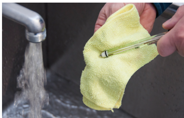
Figure 1: The first steps are to wipe away debris and rinse the sensor in water.