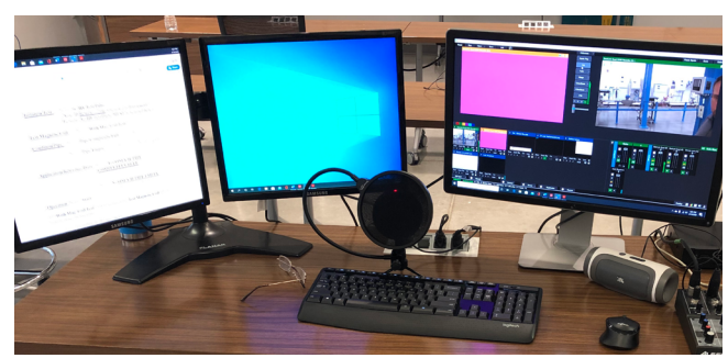
Endress+Hauser uses a professional video production platform to deliver virtual training

Simple registration and payment through existing <u>LMS portal</u> – learning records and certificates of completion are also maintained and organized in the portal