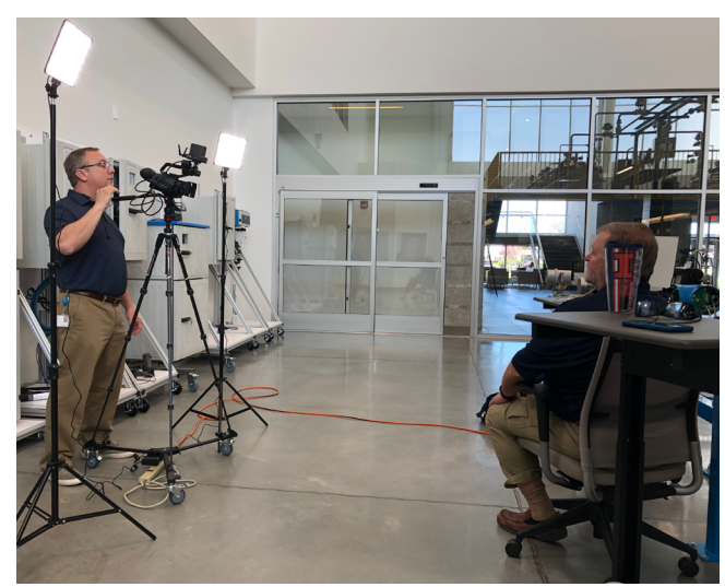
Certified instructors providing step-by-step detailed instructions through quality HD 4K cameras