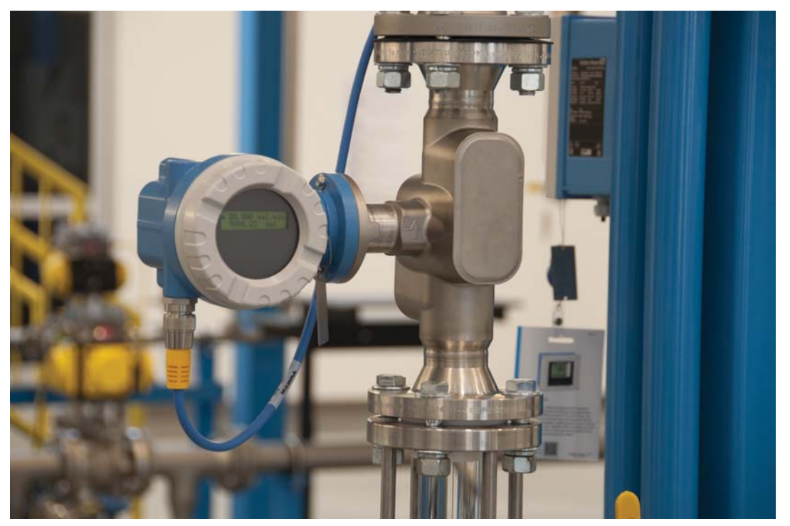
Figure 1: The world's first two-wire ultrasonic flowmeter in 2006 operated on a single, 4-20 mA 2-wire loop.

There was a major breakthrough in 2006 when the world's first true 2-wire, loop powered inline liquid ultrasonic flowmeter was introduced (Figure 1). The nature of this breakthrough was innovation in device power management. That was the missing piece up to that point, because to be a true loop powered device, it had to directly provide a full 16 mA span using less than 3.6 mA of remaining loop current and less than 1 Watt of electrical energy. The flowmeter operated on a single, 4-20 mA HART<sup>®</sup> 2-wire loop, was remotely powered by a DC supply, was certified Class 1 Division 1 and could be deployed as Intrinsically Safe through the use of an approved safety barrier.