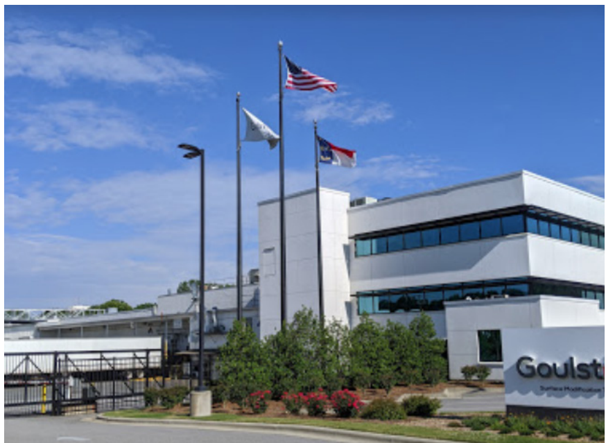
Goulston Technologies, Inc. Monroe, North Carolina

Summary: Located in Monroe, North Carolina, Goulston Technologies, Inc. is a leading provider of surface modification technologies for fiber lubricant products in the chemical industry, offering its technologies and services to customers in more than 40 countries.